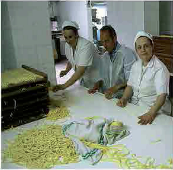
Learning to make macaroni in the traditional way.